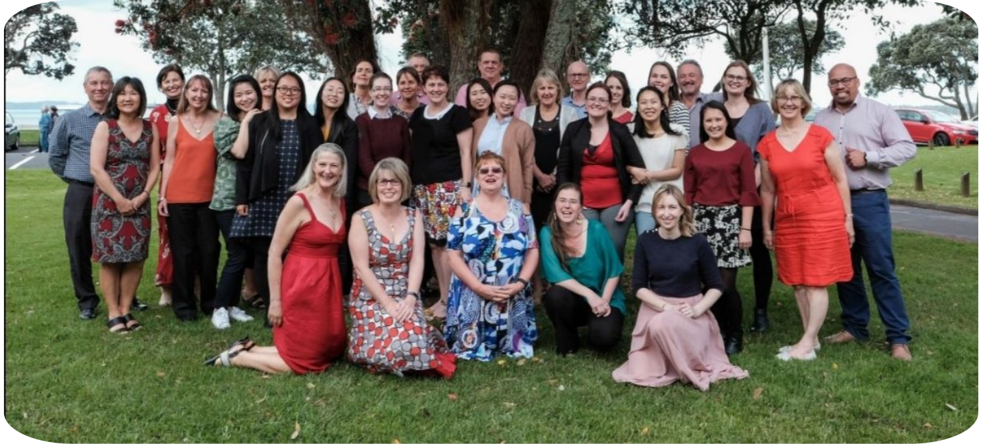
Middlemore Clinical Trials Team

Please join us in welcoming MMCT to the ClinTrial Refer community.